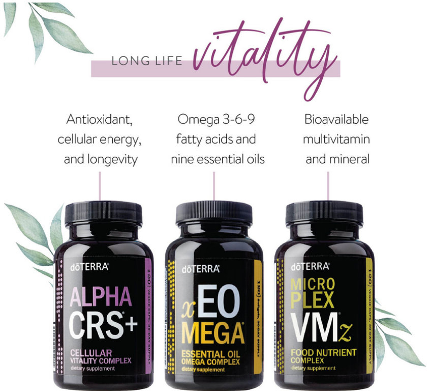
Maximum nutrition for energy, focus, relief, and well-being

Item# 60217454 Your Price AUD $191 PV 100