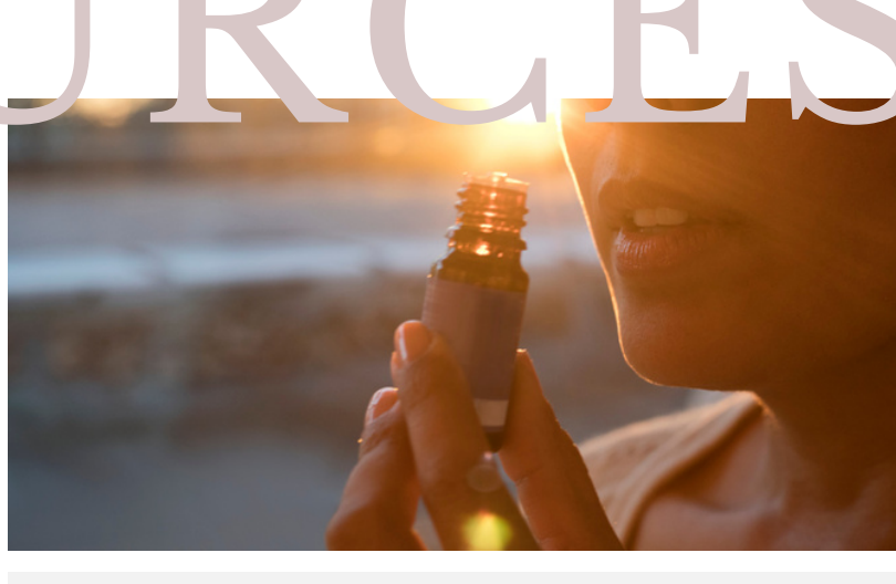
Join US Live Q&A CLASSES!