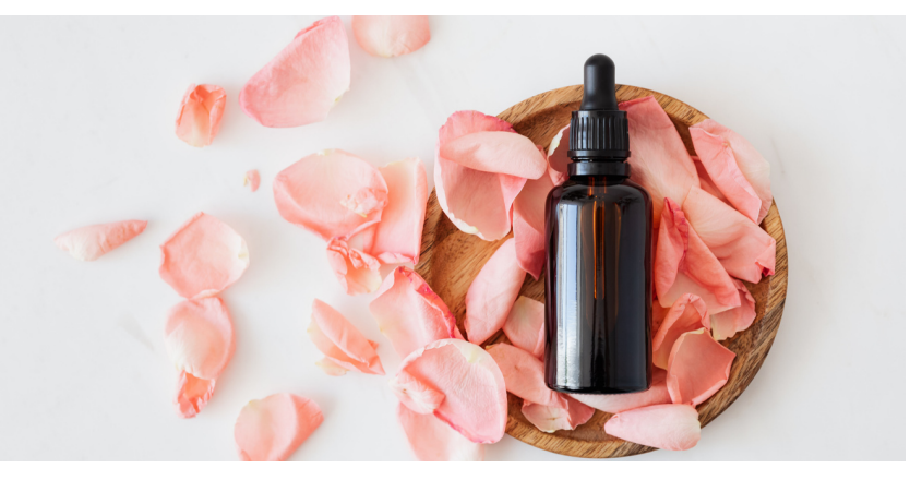
RECIPES FOR SKIN TREATMENTS